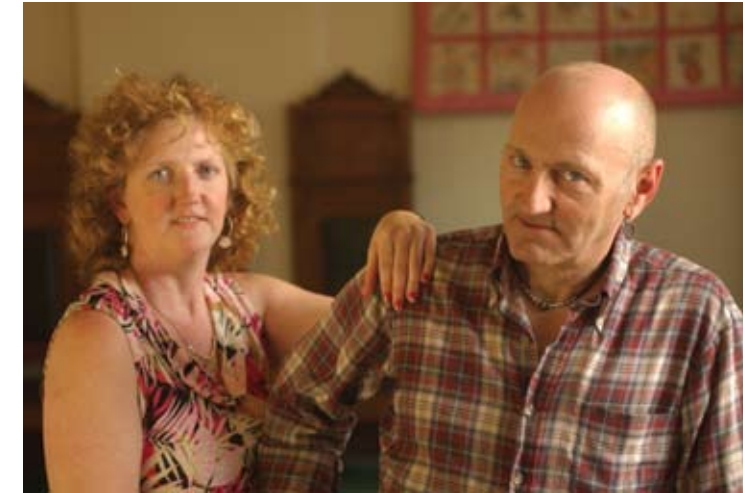
Drop Inn Center's Transitional Housing program - 18 one-bedroom apartments around the corner from the shelter. "If you really want this thing, it can be done. But you have to want it."

Warner decided to give the Full Circle program a try. "The first 90 days was a real struggle", she said. She graduated from the program on May 21, 2003, and moved into the