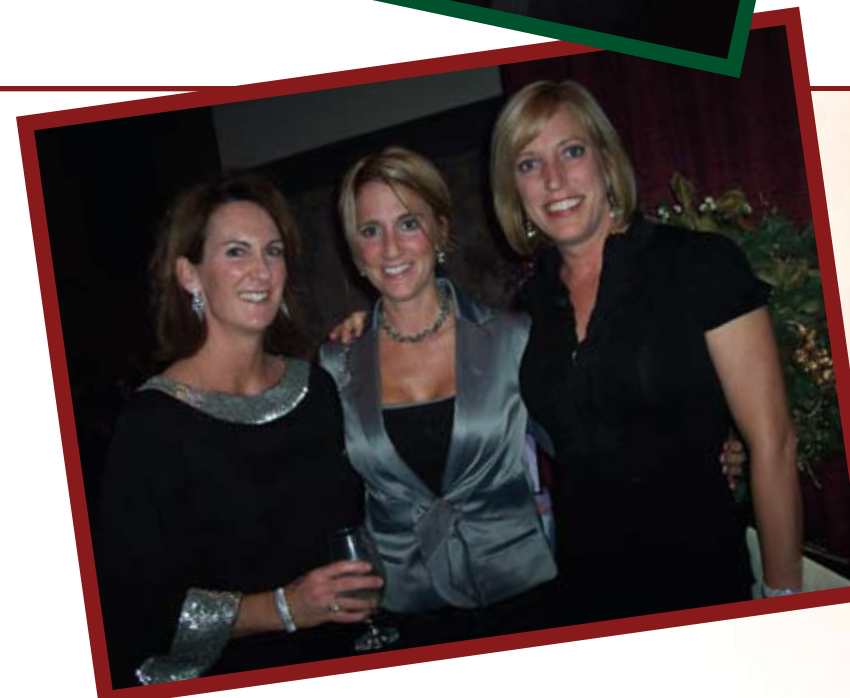
Guests enjoyed a fantastic evening at the Angels to the Homeless Gala.